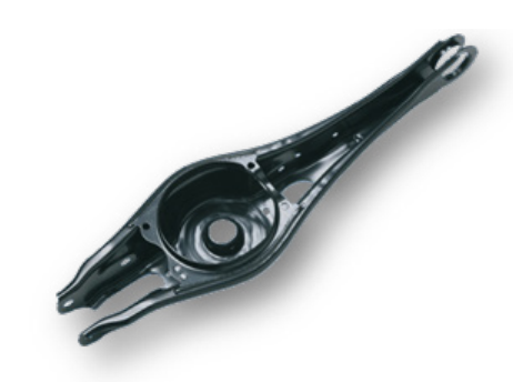
Control arm in automotive engineering

Due to its high fatigue strength, SZBS800+-ZE is particularly well suited for use in chassis parts subject to high dynamic stress. At the same time, these parts benefit from the weight-saving potential due to the high strength of the material. Typical application examples here are control arms and trailing arms as well as handlebars.