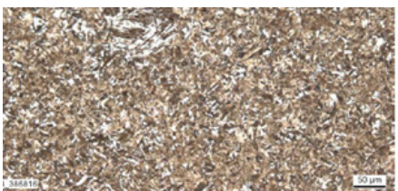
Tempered state, water cooled 200:1

In the hardened and tempered state, after suitable heat treatment the manganese-boron steels form a microstructure consisting of 100% martensite: