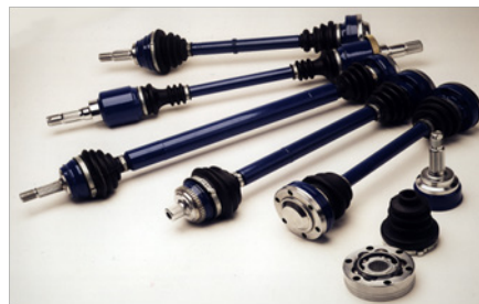
Example: drive shafts

Thanks to the combination of ductility and hardness, the 34MnB5 is particularly used for supporting body parts and safety-relevant parts in the automotive industry, such as chassis components, gear shafts or bumpers.