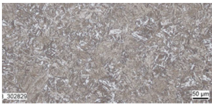
Hardened state, water cooled 200:1

In the hardened and tempered state, after suitable heat treatment the manganese-boron steels form a microstructure consisting of 100% martensite: