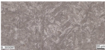
Tempered state, oil cooled 200:1