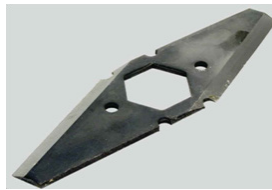
Example: harvester blades

Thanks to the combination of ductility and hardness, the 40MnB5 is particularly used for agricultural products.