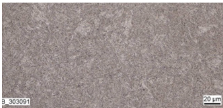
Tempered state, water cooled 200:1